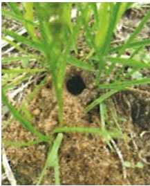
Ground nest (illustration from Pollinators of Native Plants by Heather Holm)

Ground nesting sites: Many native bee species nest in the ground. A pollinator garden must have some areas of bare ground where bees can dig out nesting tunnels. On the surface, they look like small ant hills.